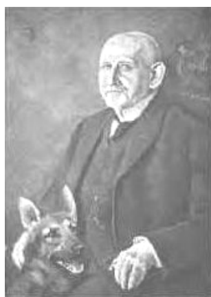
Max von Stephanitz - Gründer der SH „Sein Herz gehörte der Tierwelt“

sieger standard stephanitz strength temperament tracking training working dog