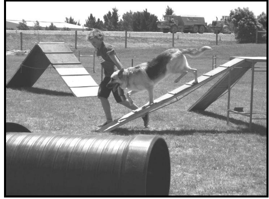
Fun day agility course