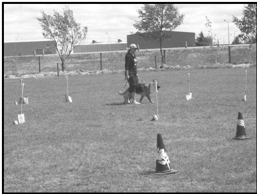
Tash on the Rally-O course at the fun day