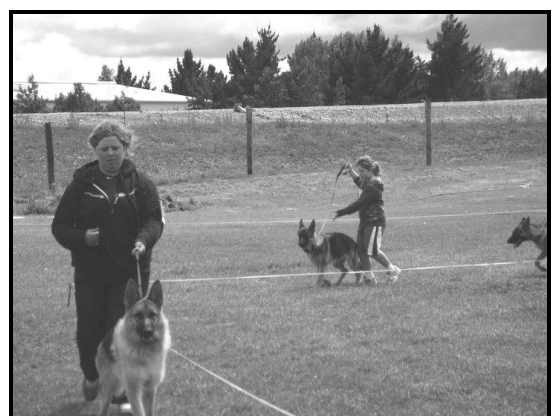
Ribbon Parade 29 th January