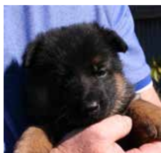
Two - Tone